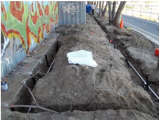
This is the irrigation that the crew has installed

This week the new Water Efficiency Job Training Crew helped out with a project at Marsh Street Park installing irrigation and planting low water usage plants. Corpsmembers have been learning about the importance of conserving water to preserve our natural ecosystem and now they are getting hands-on training in the field.