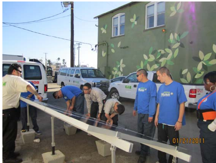
Shows LACCN Corpsmembers training to install a photovoltaic system at the NELA solar lab.

The Los Angeles Conservation Corps Network completed 80 hours of Solar Installation training at NELA with an actual installation in Compton with Grid Alternatives on Monday and Tuesday. The Corpsmembers from LA Corps and San Gabriel Valley Corps worked together to install a 2.6 kw photovoltaic at a low-income home in Compton, the resident was very impressed by the finished product.