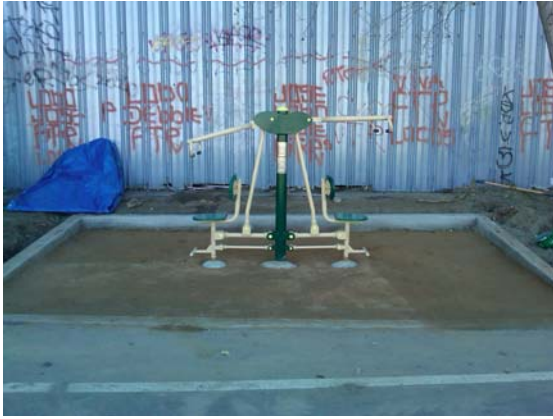
ODE (Outdoor Exercise Equipment) Complete

This week the new Water Efficiency Job Training Crew helped out with a project at Marsh Street Park installing irrigation and planting low water usage plants. Corpsmembers have been learning about the importance of conserving water to preserve our natural ecosystem and now they are getting hands-on training in the field.