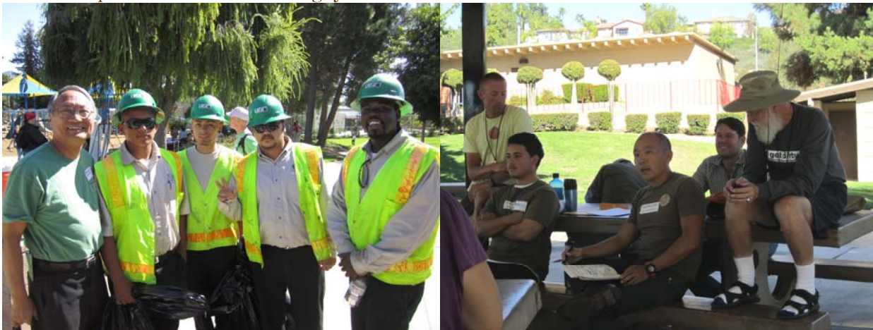
Fifth Annual Gathering of the LA Community Garden Council; Farmsworks LA Workshop on Urban Farming