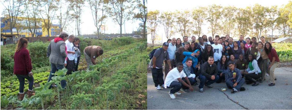
Corpsmembers at Green City Force Urban Farm

backgrounds for sustainable careers. Both groups deliberated over the importance of acquiring practical skills in the emerging green marketplace and discussed their experiences while working in their organization.