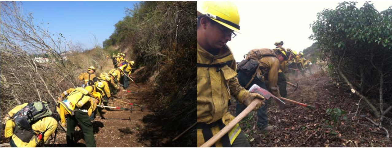
Wildland Recovery Team working on a new trail in Bundy Canyon

This week the PECI Crew found out that they were the top performers for this month out of all the PECI EnergySmart Jobs Programs across the state. The crew performed 52 direct installs and completed 77 surveys out of the 274 stores that they visited this month. The crew was excited to see their hard work pay off!