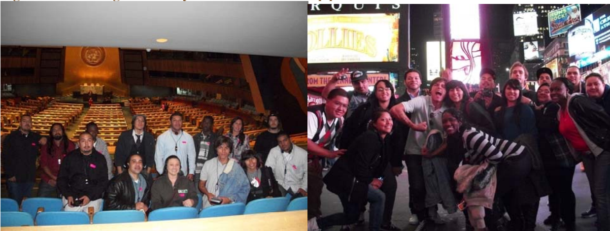
Corpsmembers touring New York City

For many students, this was the first time they got a chance to leave the State of California and actively explore the east coast. Overall, the trip was an unforgettable experience and all the students rose to the occasion maturely and working together. Thanks again to everyone who made this trip possible!