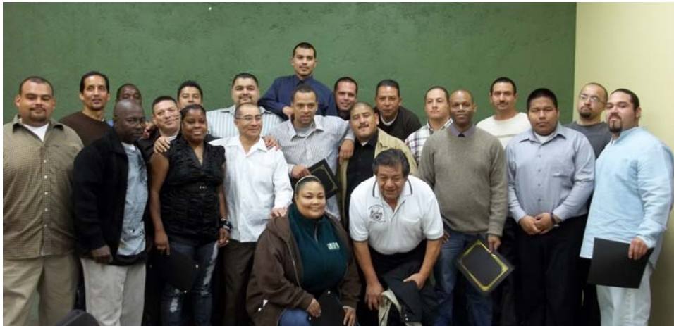
Congratulations Brownfields graduates!