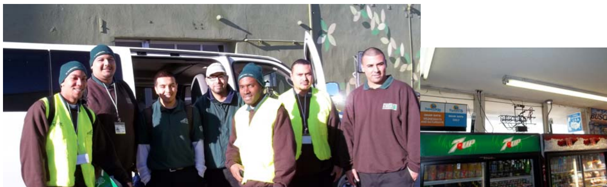
The PECL EnergySmart Jobs crew is ready to go out in the field; two beverage cooler misors that were installed by the crew

The PECL EnergySmart Jobs crew has gone all over Los Angeles introducing commercial retail outlets with refrigeration units to the EnergySmart Jobs program. Stores that participate in the program are eligible for a free energy audit survey by the LA Corps crew and a limited number of free CFLs and beverage cooler misors, which help them save energy on their reach-in refrigerators. After the survey, stores are eligible for larger rebates to improve their energy efficiency under the EnergyUpgrade California program. Crew members are responsible for promoting the program, helping the stores fill out paperwork and completing the energy audit survey!