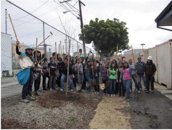
Volunteers and corpsmembers finish planting the last 5 trees