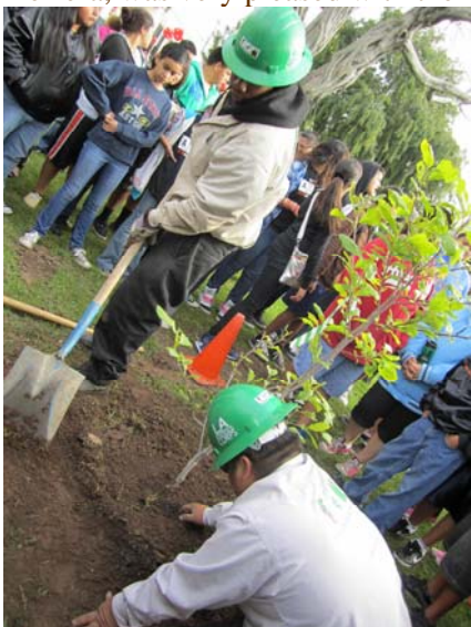
Corpsmembers demonstrate how to properly plant and water trees