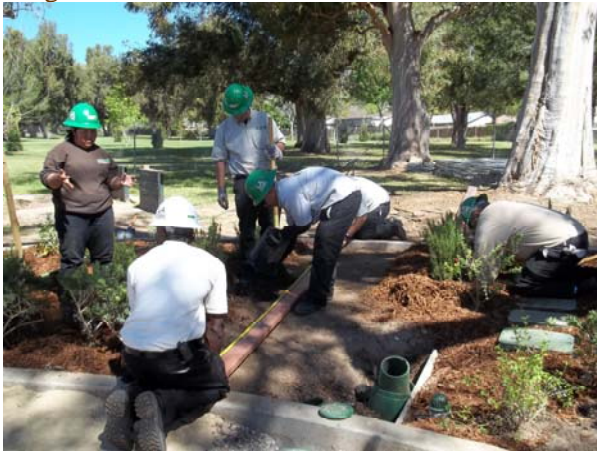
Corpsmembers measuring and creating a pathway

Earth Day 2011 for Current TV. It turned out the sound engineer went through the Corps' Afterschool Program!