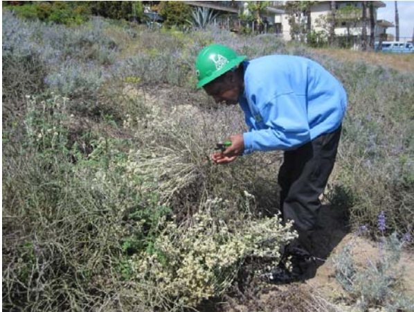
Stanley Taylor collecting seeds