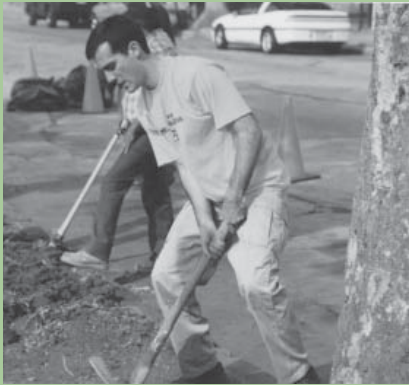
Councilmember Eric Garcetti hard at work beautifying Council District 13.