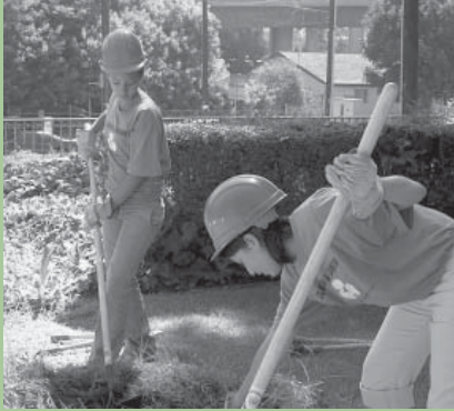
Clean & Green students creating a garden at a high school campus in Council District 13.