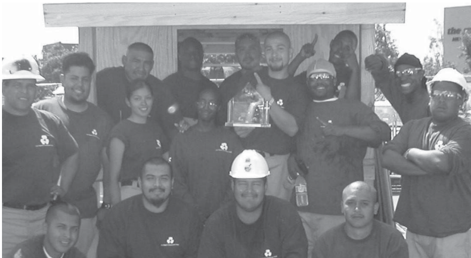
Corpsmembers from LACC's Youthbuild program enjoying their first-place victory at the 2004 Homebuilders Council construction competition